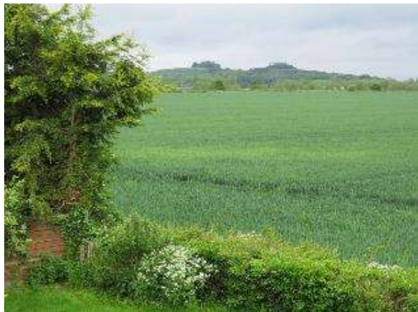
Figure 1 Wittenham Clumps, from bedroom at Brooks' house

This illustrated Journal covers a week on a narrowboat on the Llangollen Canal (30-May to 6-Jun), a trip to Prague (for the work TNC conference, 9 to 16-Jun), a cruise on the Poesia around the Western Mediterranean from Marseille (18 to 25-Jun), and a few days in Provence (in a B&B in St Maximin, 25 to 30-Jun), returning to Perth on 3-Jul-16.