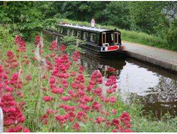
Figure 7 Llangollen Canal - narrowboat