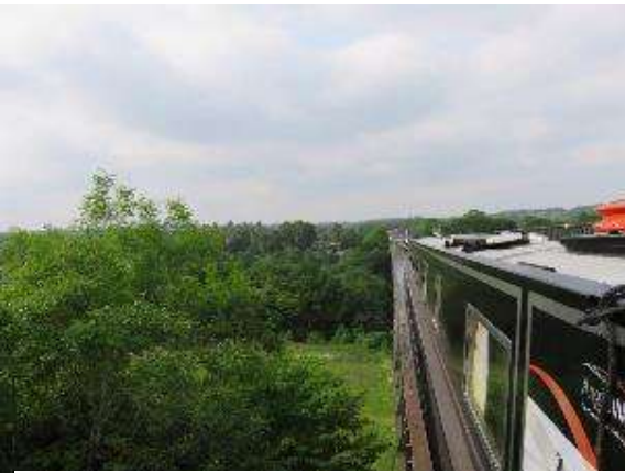
Figure 11 Llangollen Canal, Pontcysyllte Aqueduct