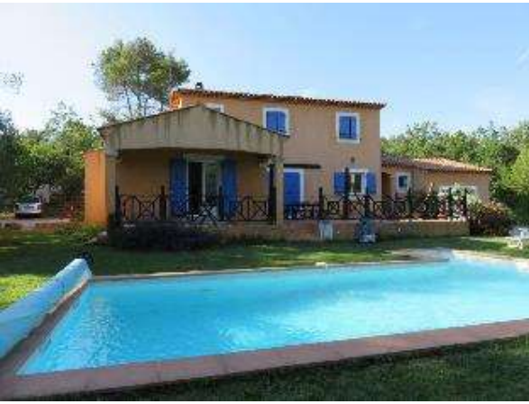
Figure 13 B&B Nuits Provençal, St Maximin, Provence 26-Jun