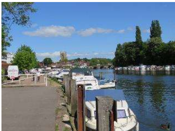
Figure 5 Henley-upon-Thames