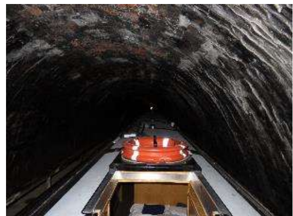
Figure 10 Llangollen Canal, Chirk Tunnel