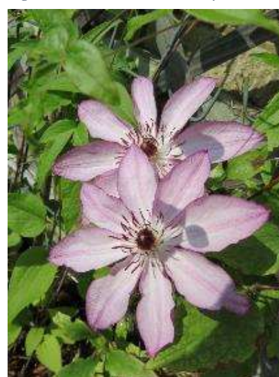
Figure 6 Clematis Corner (National Collection)