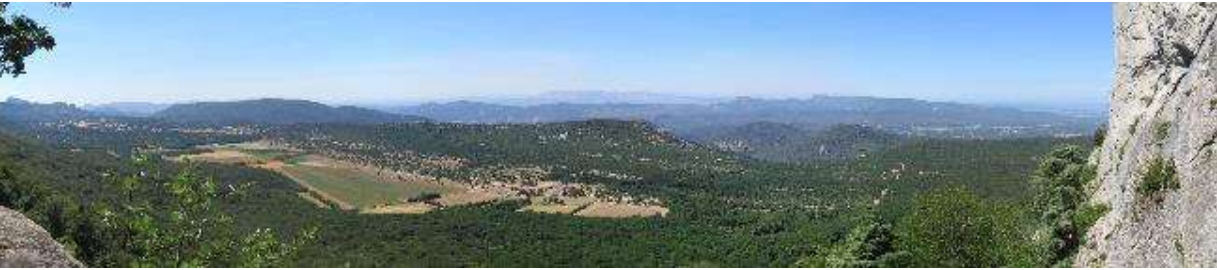
Figure 15 Panoramic view from Grotto Marie Magdalene, Provence 27-Jun