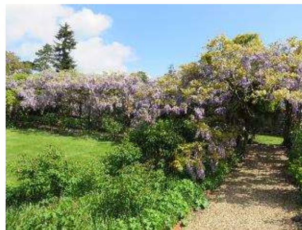
Figure 4 Ancient Wisteria at Greys Court