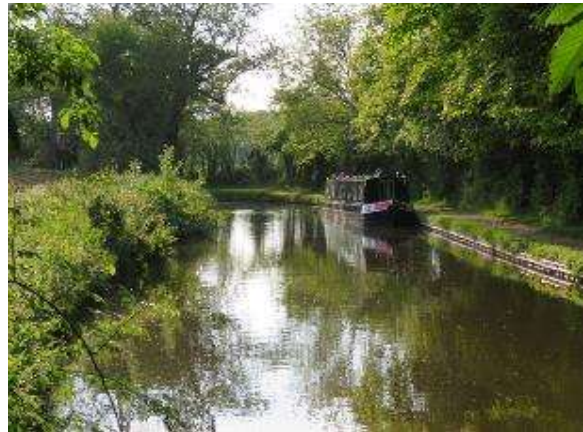
Figure 8 Llangollen Canal