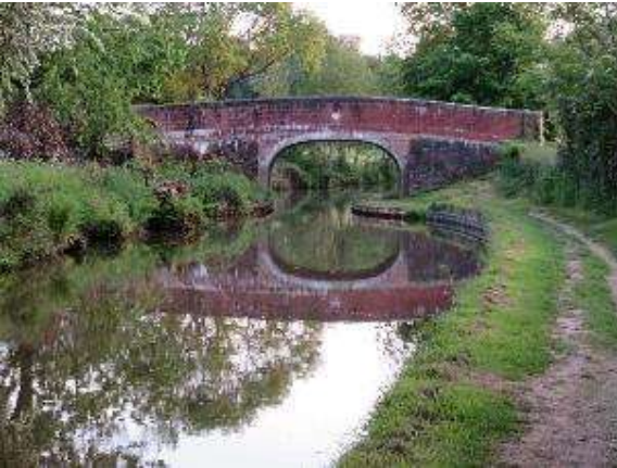
Figure 9 Llangollen Canal bridge 14W