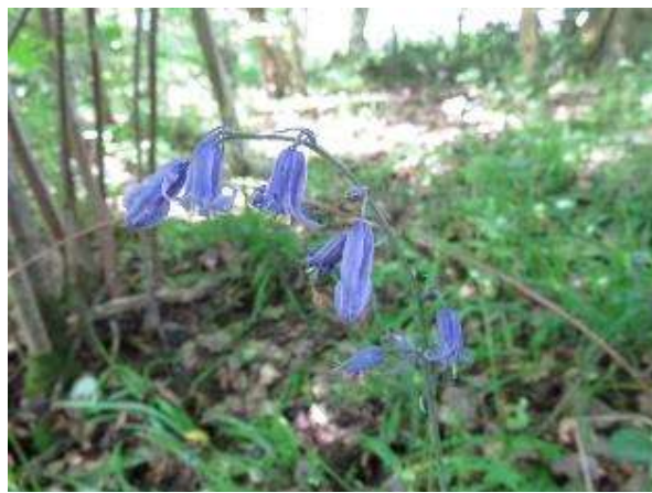
Figure 2 Bluebells at Freeland Wood