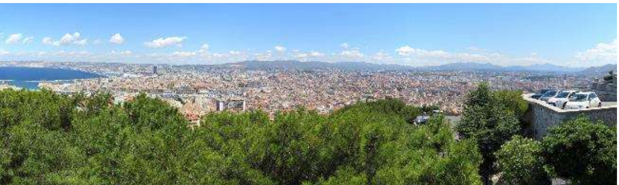
Figure 18 Panoramic view of Marseille, from Notre Dame de la Garde, 18-Jun