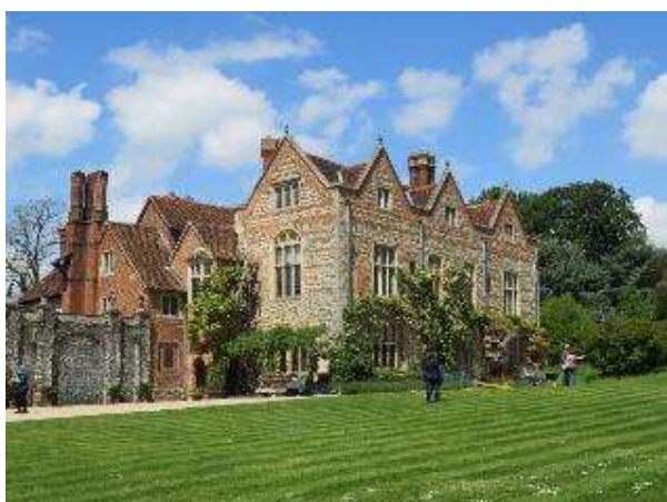
Figure 3 Greys Court