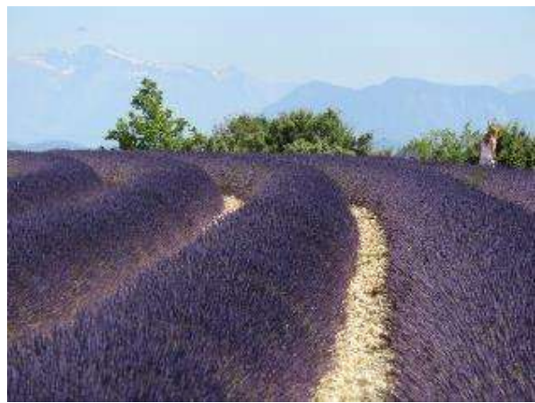
Figure 14 Valensole lavender, Provence 26-Jun