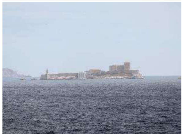
Figure 17 Chateau D'If in harbour, Marseille, 18-Jun