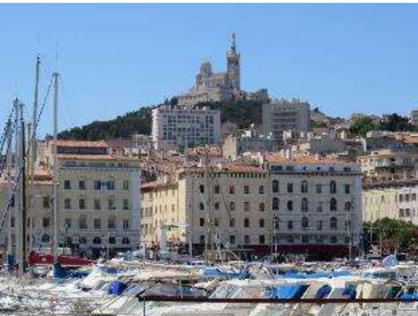
Figure 16 Notre Dame de la Garde, from boat harbour, Marseille